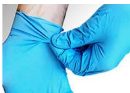
Step 1: Grasp outside edge of glove near wrist. Peel glove away from hand, turning glove inside out. Hold removed glove in opposite gloved hand

REMEMBER: TAKE YOUR GLOVES OFF FIRST, THEN TAKE MASK OFF