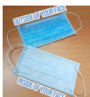
Step 4: Carefully fold the mask over so the outer sides are touching each other. Consider marking the outer edge with a marker to reduce confusion.