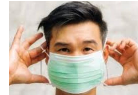
Step 3: To remove mask, using ungloved hands, grasp the ear loops and lift away from face.