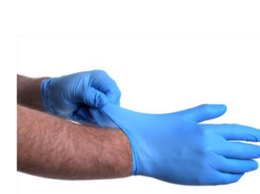
Step 4: Put on gloves slowly to avoid ripping. Ensure a snug fit. Check for holes or tears after they are on.