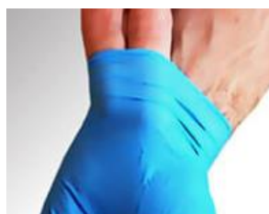
Step 2: Slide ungloved finger under the wrist of the other glove. Peel off from inside creating a bag for both gloves. Throw Away.