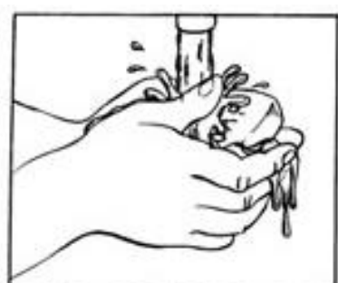
1. Wet hands with soap and warm water.

Follow these 5 simple steps to effectively wash your hands often and correctly!