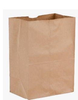
Step 5: Place folded mask in a clean paper bag. (Do not use plastic bags) If mask is soiled or torn, please throw away.