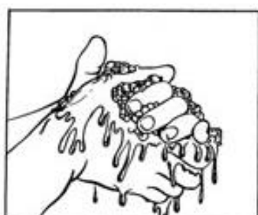
2. Rub hands for 20 seconds. Get under fingernails and between fingers.