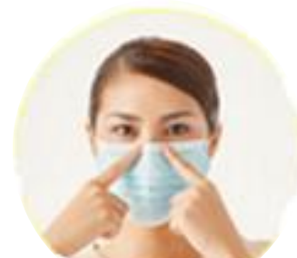
Step 3: Pinch the metal strip or stiff edge of mask so that it takes the shape of your nose bridge. Adjust to fit snugly around your face with no gaps. Avoid touching mask until removal.