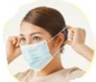
Step 2: Hold the mask via the ear loops, and ensure that it covers your mouth and nose. Then place the loops over your ears.