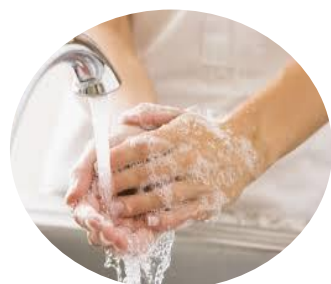
Step 1: Wash Your Hands for 20 Seconds

REMEMBER: MASK SHOULD BE PUT ON FIRST, THEN PUT GLOVES ON